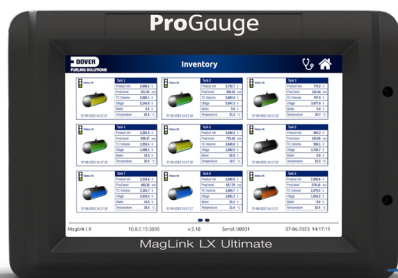
ProGauge MagLink LX Ultimate console